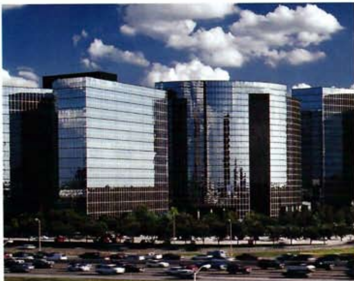
CORPORATE HEADQUARTERS | DALLAS, TX