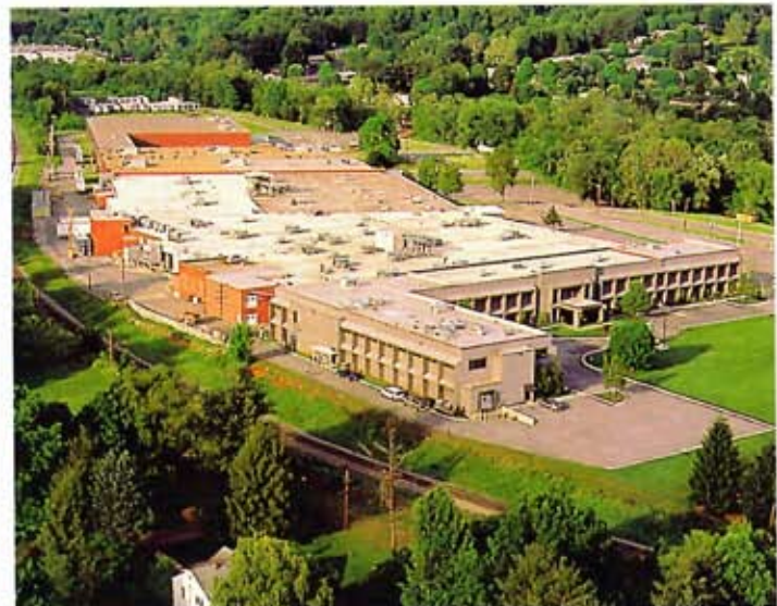
MANUFACTURING PLANT | BRISTOL, VA